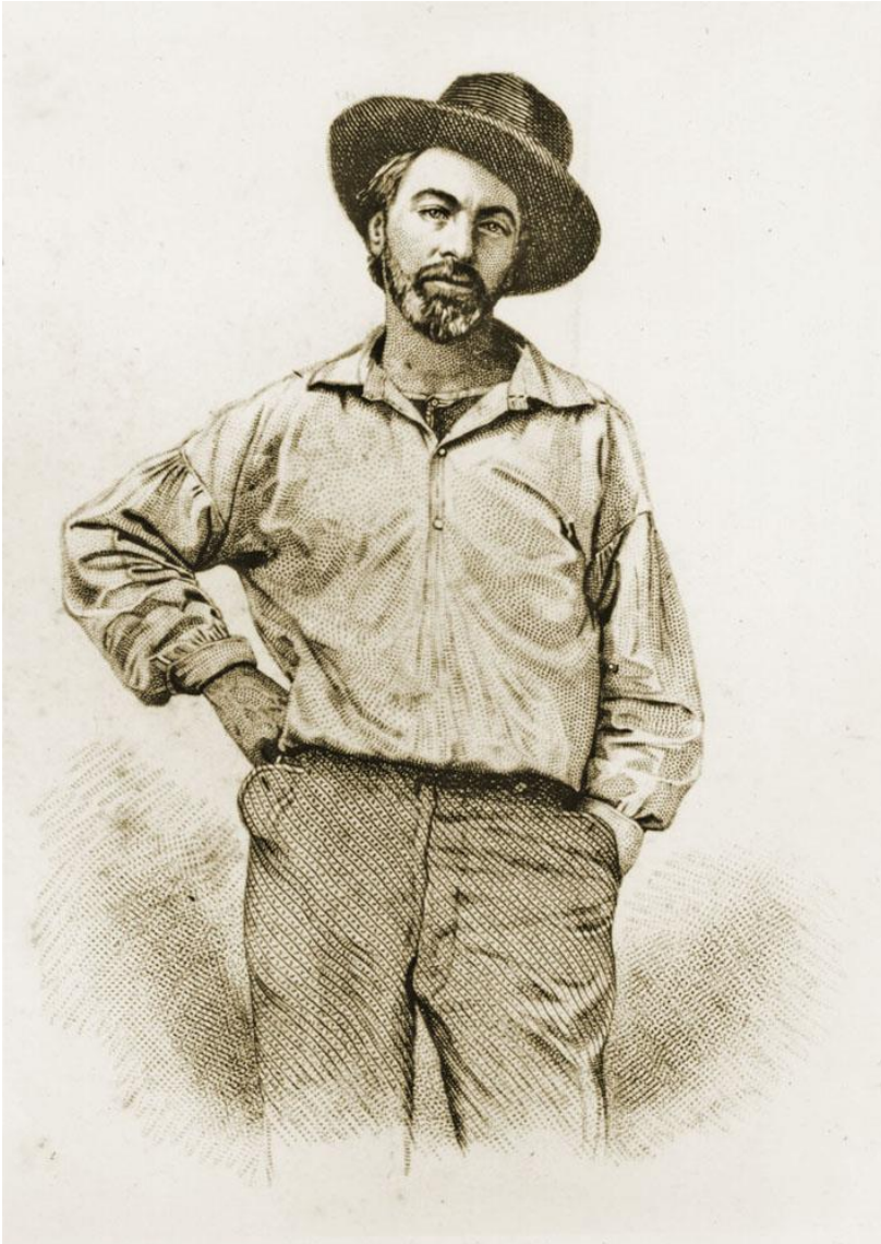
Fig. 1. Walt Whitman by Samuel Hollyer, engraving of a daguerreotype by Gabriel Harrison (original lost), 1854.