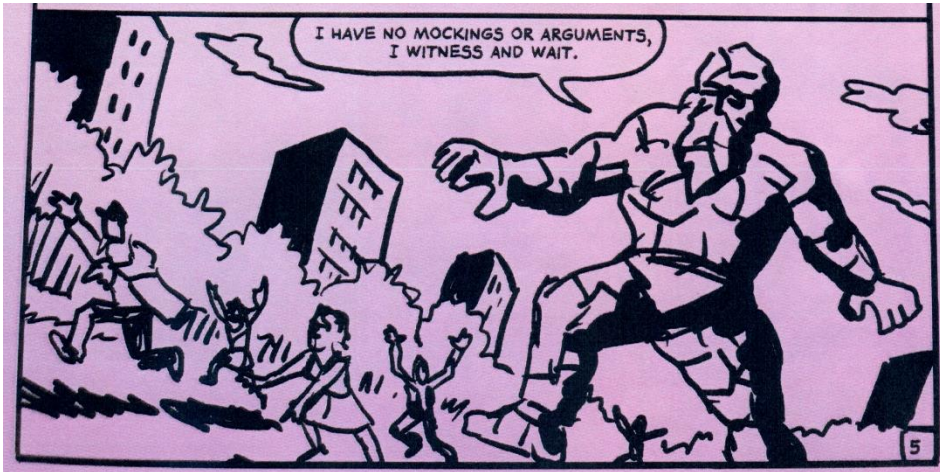
Fig. 4. Robert Sikoryak, Song of Myself! , p. 5. Copyright © 2013 R. Sikoryak.