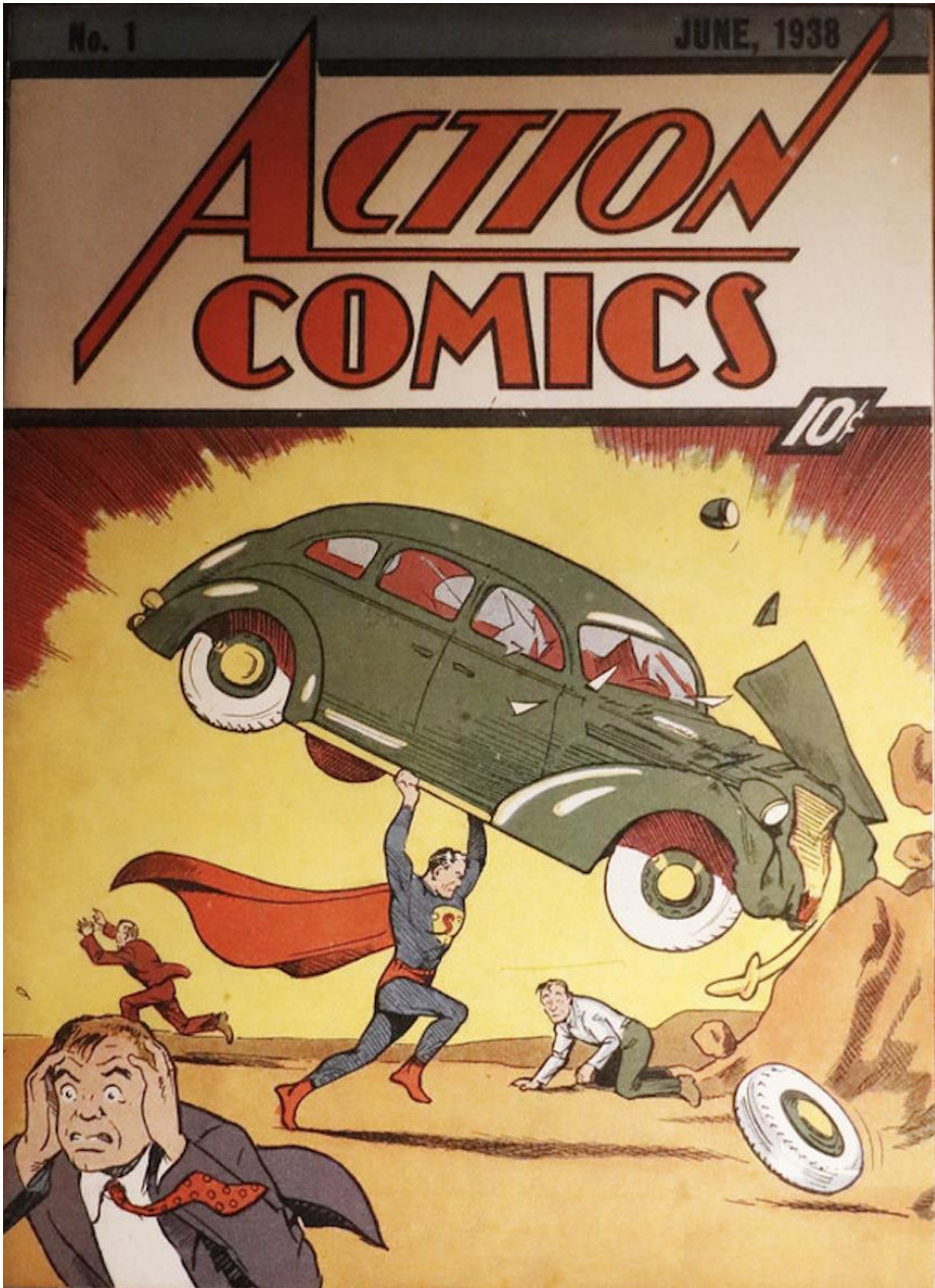
Fig. 3. "Action Comics No. 1" by greyloch is licensed under CC BY-NC-ND 2.0.