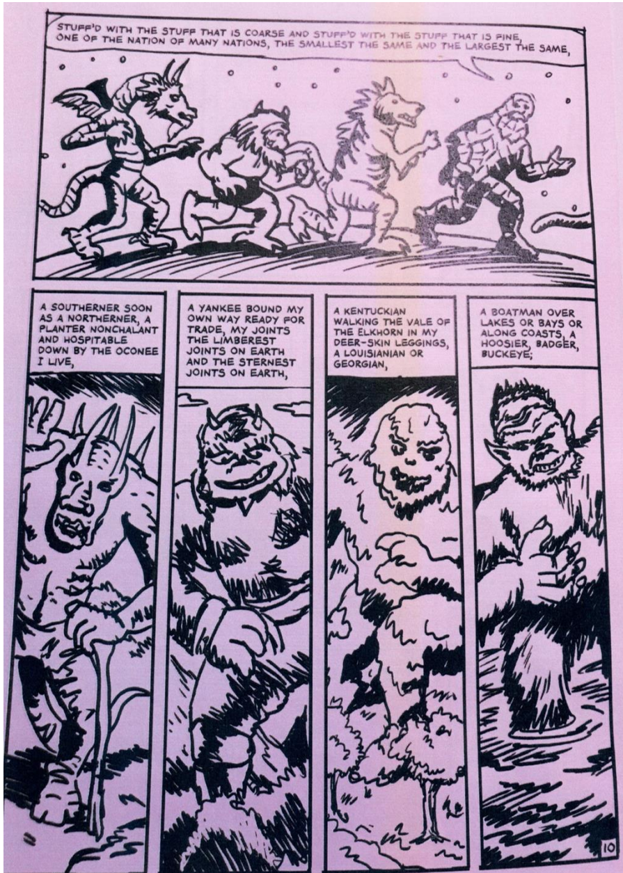
Fig. 5. Robert Sikoryak, Song of Myself! , p. 10. Copyright © 2013 R. Sikoryak.