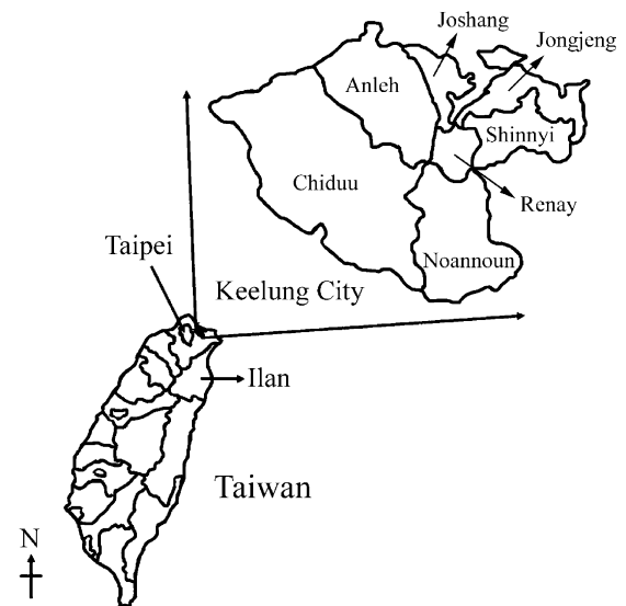
Fig. 1. Keelung city is the northernmost city of Taiwan. It is located near Taipei, the capital of Taiwan. It consists of seven administrative regions. The Keelung community-based integrated screening is survey covered all regions. Previous epidemiological study was performed at Ilan in 1993. Ilan is located in the northeast area of Taiwan.

one part of a community screening service: Keelung community-based integrated screening (KCIS). The implementation and preliminary findings of KCIS are described in detail elsewhere (Chen et al., 2004; Tung et al., 2004; Hsu et al., 2005; Chiu et al., 2006). Briefly, the KCIS screening program is a multiple disease screening service which targeted at residents aged over 30 years old living in Keelung. This screening service was provided between 1 January 1999 and 31 December 2001. All seven administrative regions within this city were covered. Pap smear screening was the basis for integrating other screening regimens into KCIS study, including tests for breast, liver, colorectal and oral cancer, type II diabetes mellitus, hypertension, hyperlipidemia, and neurological disorder screening. From 1 January 2001 to 31 December 2001 the epilepsy survey was integrated into this screening service.