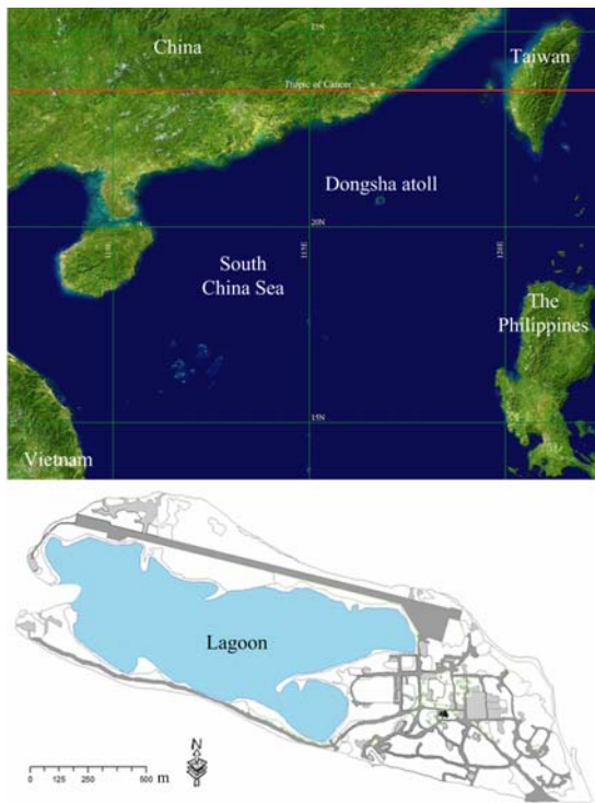
Fig. 1. Geography of the Dongsha Island in the South China Sea with an aerial photo showing the vegetation cover and lagoon.

observed vegetation belonged to a secondary or artificial introduction due to the fishery exploitation during the past hundred years and the military campus upon more than half a century ago.