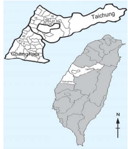
Figure 2. The distribution of the study population in Taichung and Changhua counties in central Taiwan. Numbers indicate the number of study subjects per township.

We invited registered nurses who were receiving continuing education in central Taiwan to administer the neuropsychological tests for this study, and 20 responded. The