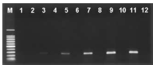
Figure 4 Comparative sensitivity of PCR detection of Las in different instars and adults of the psyllids. DNA was prepared from 25 psyllids, and 250 ng of DNA was used for the PCR template. The Las-specific 226 bp (arrow) band was amplified from samples of the second (lane 3), third (lane 5), fourth (lane 7) and fifth (lane 9) instars, as well as from adults (lane 11) reared on the Las-infected citrus plant. Las could not be detected in the sample of the first instar from the diseased citrus host (lane 1). The samples of nymphal and adult psyllids collected from the healthy citrus plant were the corresponding negative controls (lanes 2, 4, 6, 8, 10, 12 for first, second, third, fourth, fifth instars and adults, respectively). Lane M, 100 bp DNA ladder for size markers.

d In week 0 the test was conducted immediately before the psyllid population was transferred to a CJO plant.