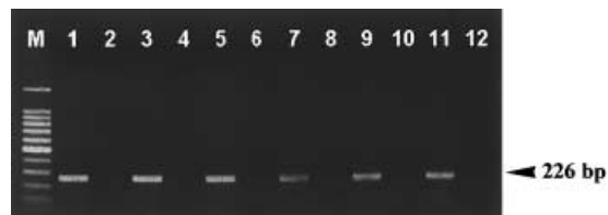
Figure 1 Detection of Las in single and multiple adult psyllids by PCR using a Las-specific primer pair. The template was 250 ng DNA extracted from 1, 3, 5, 10 and 25 adults. PCR products were analysed by electrophoresis in a 1.4% agarose gel, and positive results were recognized by the appearance of the Las-specific 226 bp band. DNA samples extracted from one, three, five, 10 and 25 adults inhabiting the Las-infected citrus plant were Las-positive (lanes 1, 3, 5, 7 and 9, respectively), whereas those from one, three, five, 10 and 25 adults inhabiting the healthy citrus plant were Las-negative (lanes 2, 4, 6, 8 and 10). Tissues from Las-infected and healthy citrus leaves were included in this test (lanes 11 and 12) for comparison. Lane M, 100 bp DNA ladder.

Forty-four adult psyllids on the Las-infected LSO plant were collected for DNA extraction as well as Las detection after a 2-week acquisition-feeding period. Las-carrying psyllids were detected by PCR assay using the Las-specific