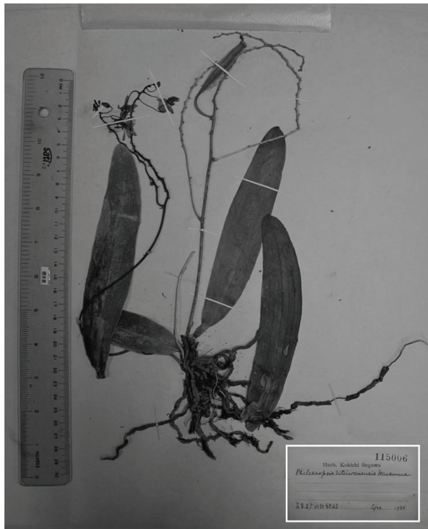
Fig. 1. Lectotype of Phalaenopsis riteiwanensis Masam. in the Herbarium of Taiwan Forestry Research Institute (TAIF).

(2001) and Chung (2009) to consider Phalaenopsis equestris Critically Endangered (CR B2ab; D) in Taiwan based on an area of occupancy less than 10 km 2 and matured individuals less than 50. Conservation measures should be taken immediately to ensure the continued existence of P. equestris in Taiwan. Although Phalaenopsis equestris had been a common species in the Philippines (Lin, 1977), we maintain its regional protection level in Taiwan because the wild population in the Philippines continues deteriorating due to horticultural over-collection (Chung, pers. comm.), and the immigration probability is thus reduced.